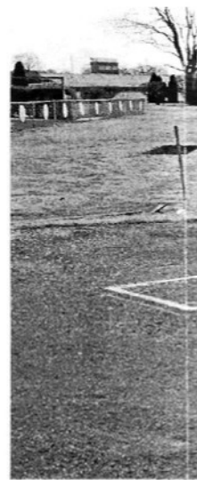
What a difference! - 2005. Sports field now clearly understand