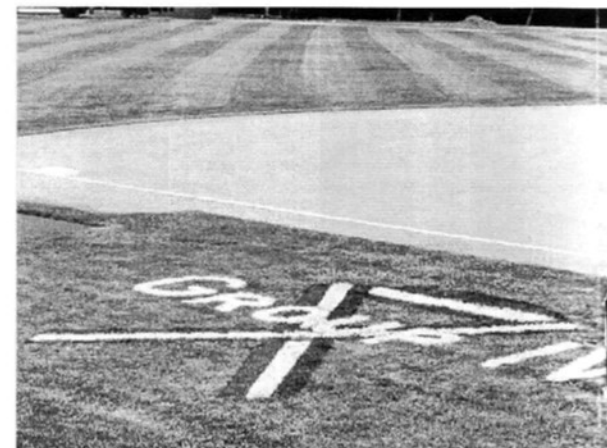
Delaware Valley Regional High School won the 2005 SFMAA of the Year contest. Here, Del-Val pays respect to the victims barbaric 9-11 attacks on our Nation.

(732) 821-5767 FAX (732) 821-0130 springirr@netzero.com