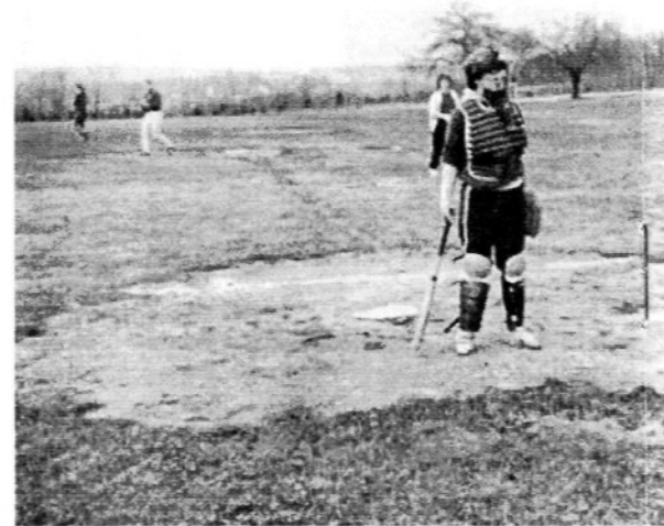
The infield at Del-Val Regional High School in 1983.