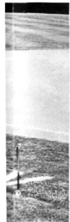
ANJ Field ns of the