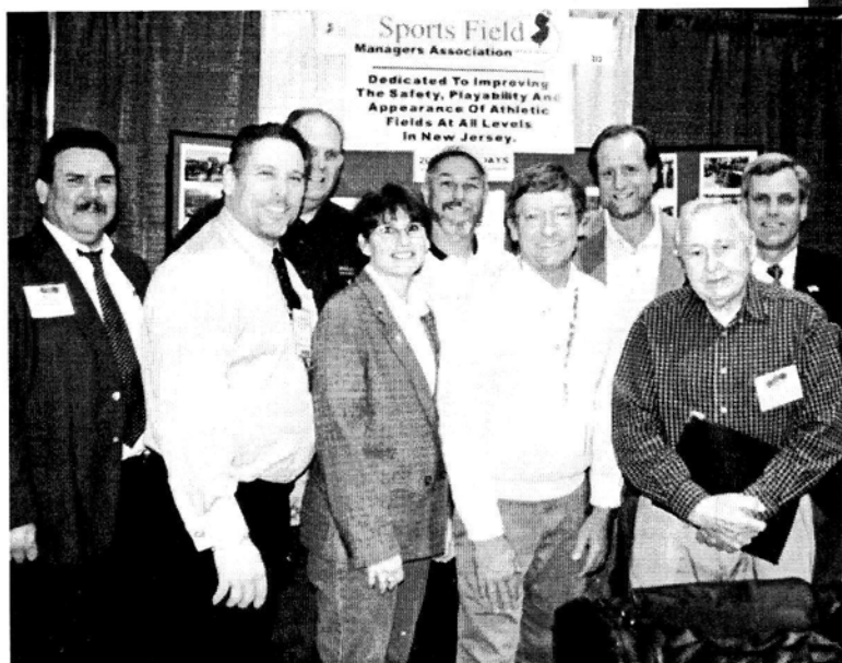
Expo SFMANJ - Board of Directors