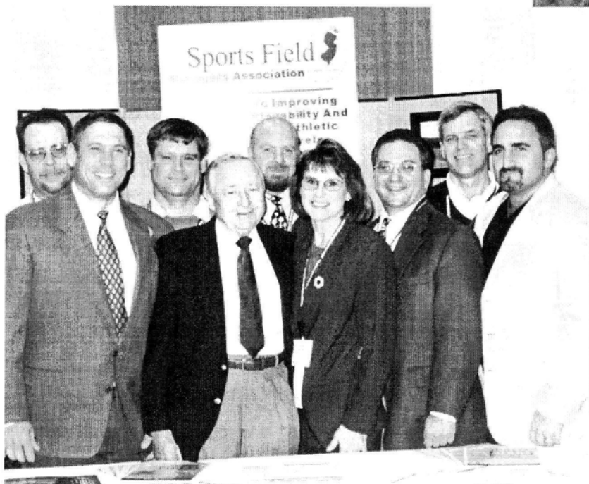
2003 NJTA Expo Conference