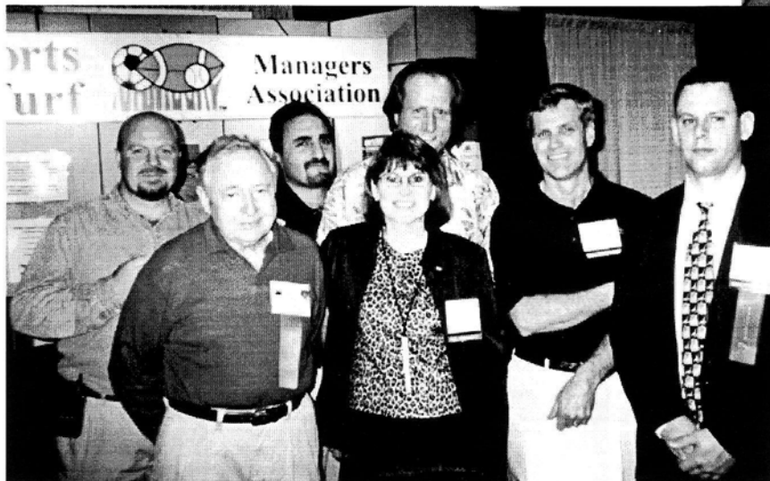
First SFMANJ Board of Directors Jan. 2000 at National STMA Convention.