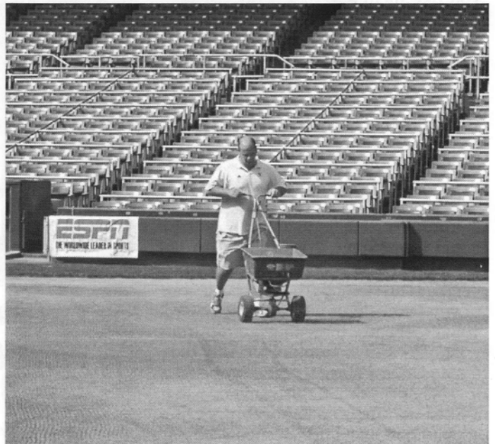
A rotary spreader is used to apply calcined clay to the Yankee Stadium infield skin prior to the evening game. ♦