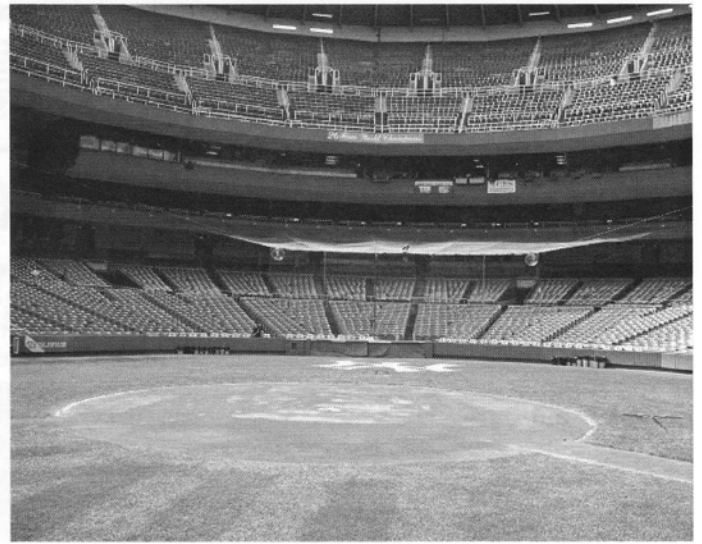
The meticulously maintained home plate area at Yankee Stadium. ♦