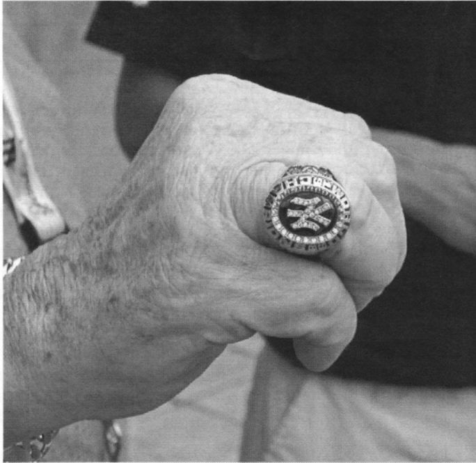
A Yankee employee shows the Rutgers Turf Club his 1998 World Series Ring. ♦