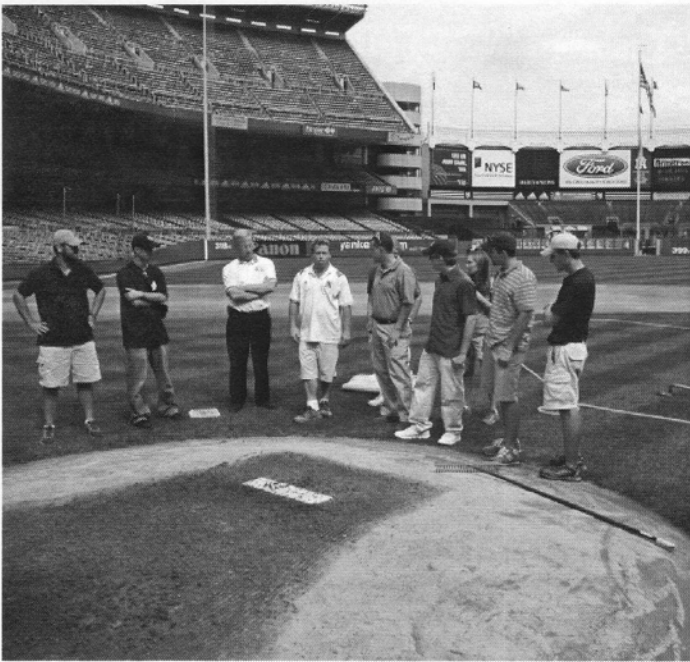
The Rutgers Turf Club was given the opportunity to examine the pitcher's mound as part of a visit to Yankee Stadium in September. ♦