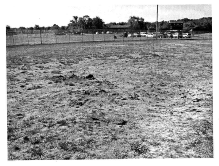
Damage caused by white grubs was the turf topic of the day at the September 28, 2005 District Meeting. ◆