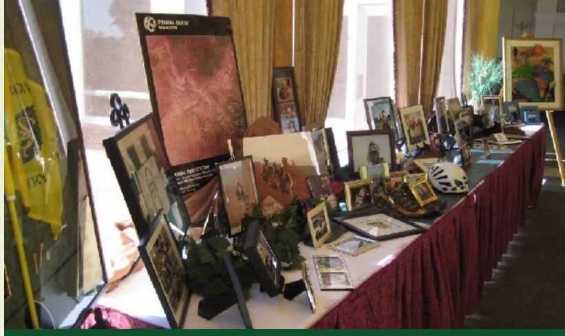
In tribute to recent award winners, there was a full display of photos and memorabilia highlighting the honorees and their many accomplishments.