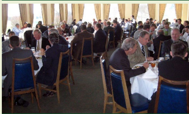
GCSANC Members had an opportunity to visit while devouring a scrumptious lunch prepared by the California Golf Club chef.