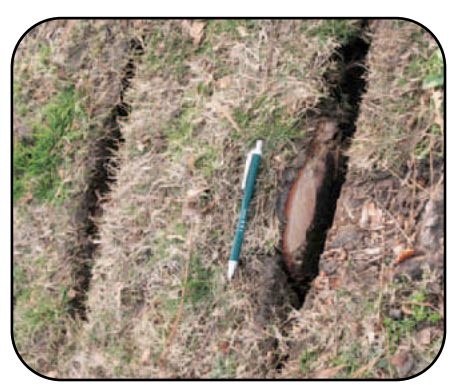
Prunes roots up to 5" in diameter with a maximum depth of 10"

- CUTS ROOTS -- DRAINS WATER -- NO CLEAN UP -