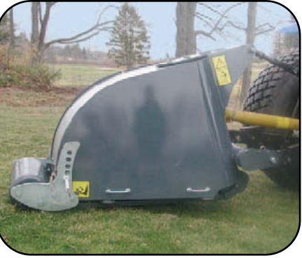
Perfect for drainage problems on greens, tees, fairways and roughs

FOR DEMONSTRATION, SERVICE, SALES OR RENTAL, CALL LARRY LANE