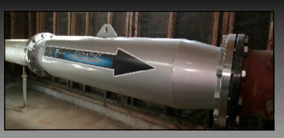
Installation at a Southern California Golf Course

Increase root growth and nutrient uptake