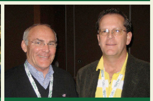
Target Specialty Team at California Forecasting Luncheon.