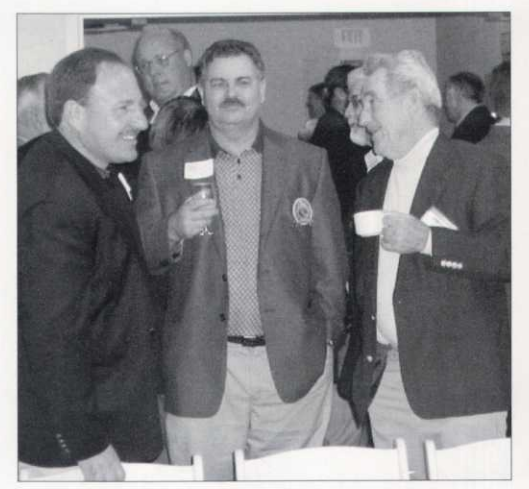
A little break time bantering!