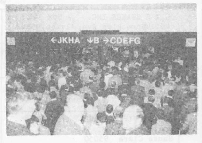
Open the Gates