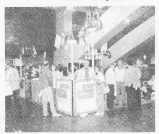
The Trade Show