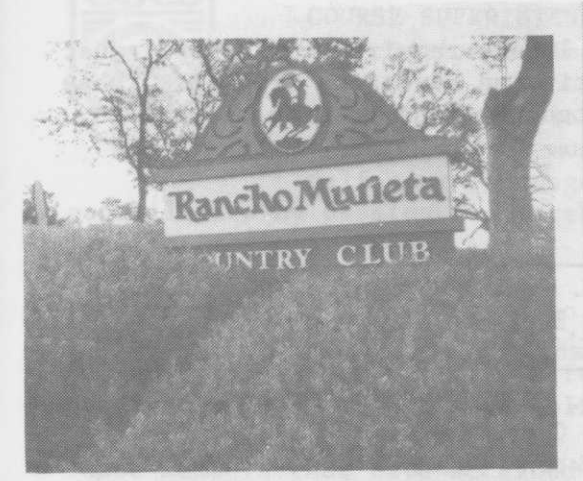
1986 Annual California State Meeting - Rancho Murieta