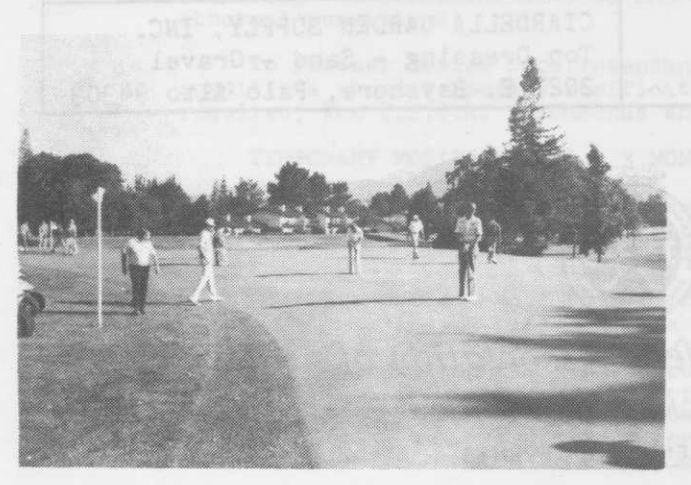
Everyone looks ready to go.