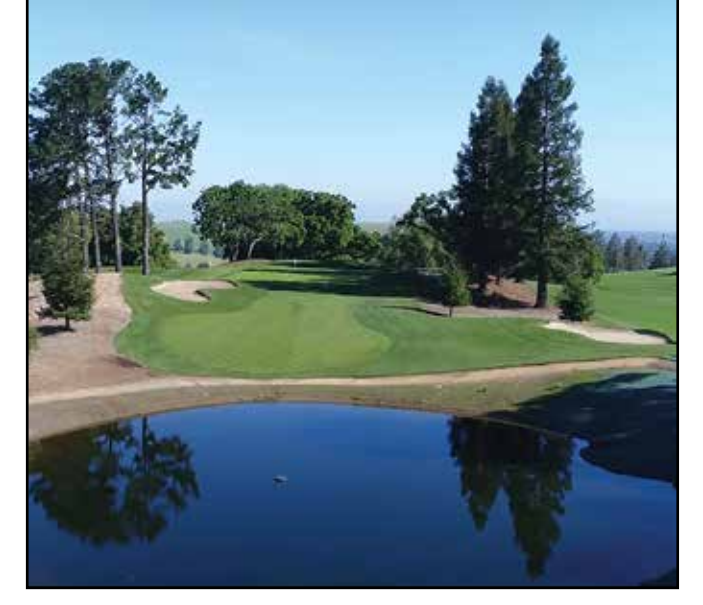
Palo Alto Hills Golf & Country Club