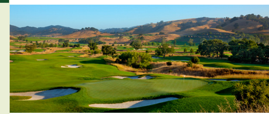
Corde Valle by day.