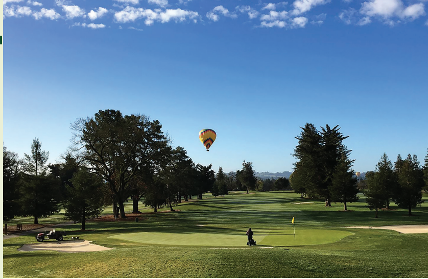
Santa Rosa Golf & Country Club, 2017 Annual Meeting Host