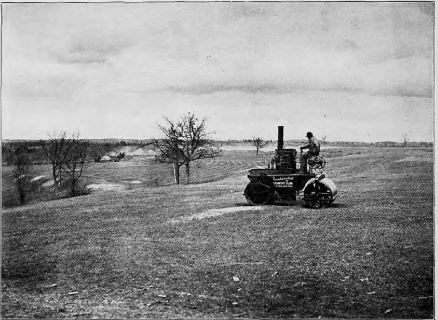
ON THE COURSE, LAMPTON GOLF AND COUNTRY CLUB, TORONTO.

proclaiming the efficiency of the roller, "All roughness of the ground upon which the roller has operated has disappeared, and it is no exaggeration to say that with its aid perfect putting greens could be obtained on any part of the course."