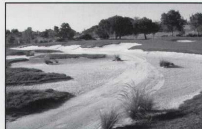
Newly designed waste bunker