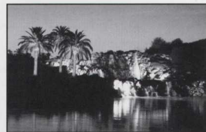
Sunset on one of the many water features at Silver Creek Valley CC