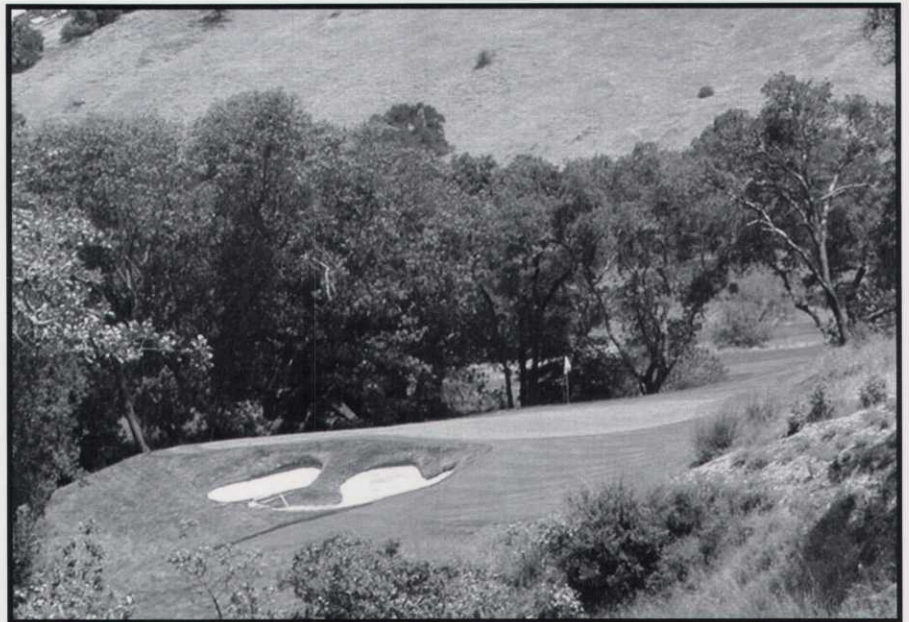
Above: The tightly guarded third at Mayacama, Below: The practice range

My two years at Mayacama have been lengthy ones. I would have never thought I could have done it a few years ago but as the project grows I have become more and more excited to be here. Being involved in such a quality operation is fun and I am dedicated to working to make it as good as it can be. I continue to learn on a daily basis and hope to further my knowledge through seminars, classes, experiences and people. As Cordillera continues to look for other projects to be involved with I find myself wondering where my career path will take me. But for now and the foreseeable future I am stoked to call this beautiful place called Mayacama home. /