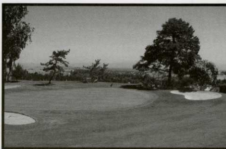
Above: Palo Alto Hills 9th Green overlooking the Bay