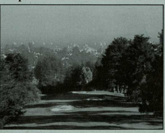
#1 at Pasatiempo