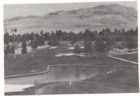
The pond by the club house makes a pretty good catch basin for run off but its level is dropping weekly.