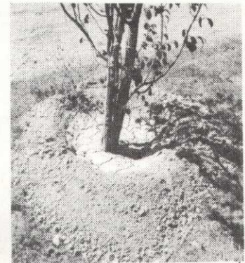
One of many tree wells.