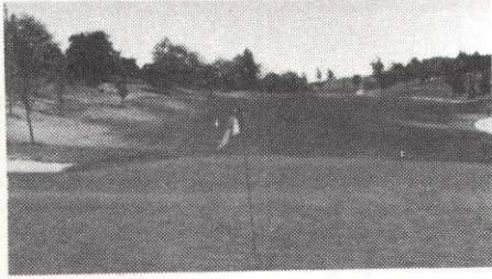
Better hit the ball straight if you want to play on the green grass.