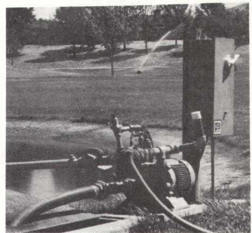
Pump system put in to use the pond water for traveling sprinklers.