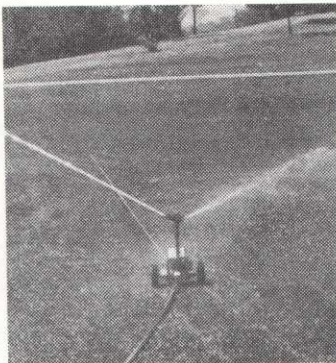
Traveling sprinkler in motion.