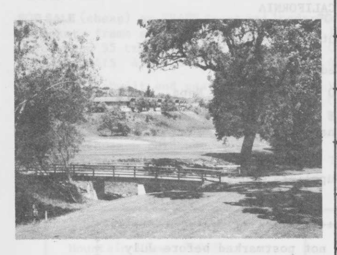
13th Hole Rossmoor