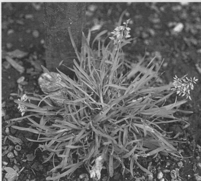
Kentucky bluegrass encroaches into landscape beds via rhizomes.

The mechanism of the development of a resistant is fairly straightforward. In a genetically diverse population, there can be several to many population members that have naturally evolved characteristics that allow these individuals to survive a specific herbicide application. If these individuals can successfully reproduce, they can rapidly become the dominant portion of a population, particularly if repeated applications of the same herbicide puts the resistant