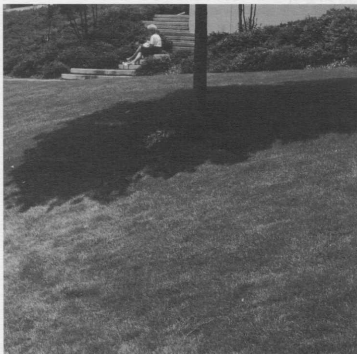
Unseasonably dry weather like that experienced in the Southeast can encourage certain insects like chinch bugs. Treated and untreated plots show how much damage they can cause.

These nutrients are likely to be limiting if bentgrass is growing on a sand-based green to which no micronutrients have been added. Even a soil-based green from which clippings have been removed for