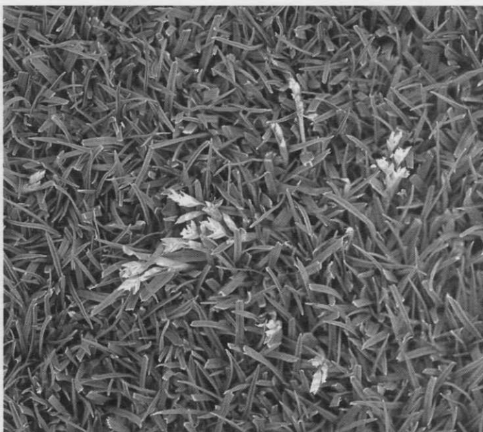
Annual bluegrass has developed resistance to many herbicides.

That is not to say that I am completely against the concept of herbicide-resistant turfgrasses. For example, a glufosinate-resis-