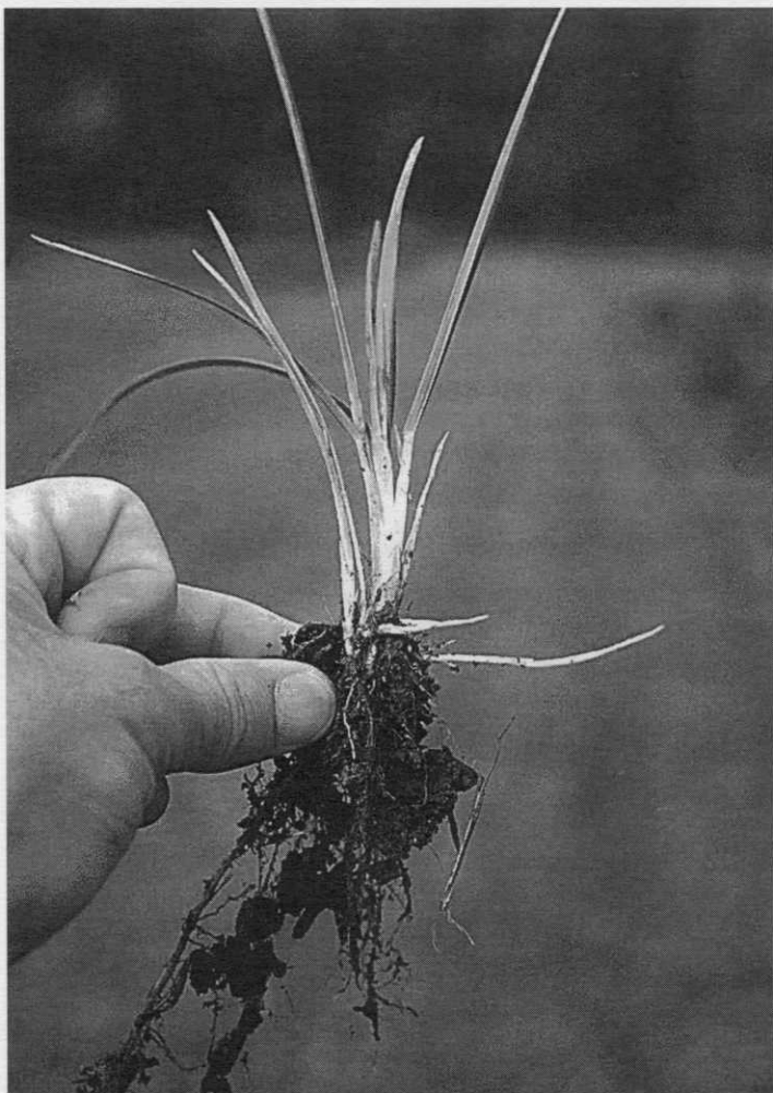
Annual bluegrass in a creeping bentgrass green. Is herbicide resistant turf the answer?

Neither the postemergence selective grass herbicides nor Finale are effective alternatives for turfgrass renovation. Other herbicides effective on perennial grasses would leave a soil residual that would prohibit reseeding or planting.