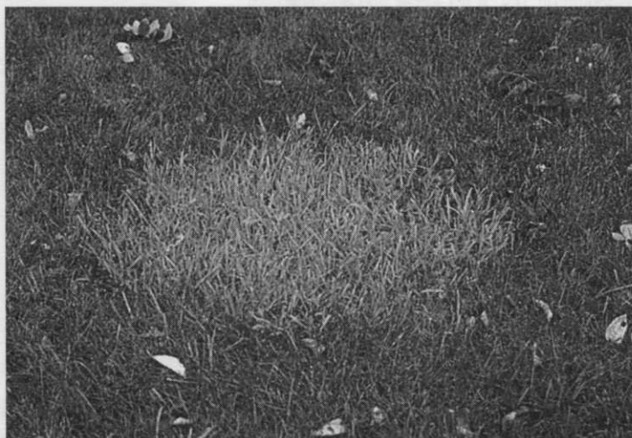
Selectively controlling perennial grasses like this velvetgrass (Holcus lanatus) in a Kentucky bluegrass lawn may be possible if herbicide resistant turfgrasses become a reality. But at what cost?

We could reduce the environmental load of herbicides used in turfgrass management; and, since herbicides account for the majority of pesticides used in turf maintenance, the