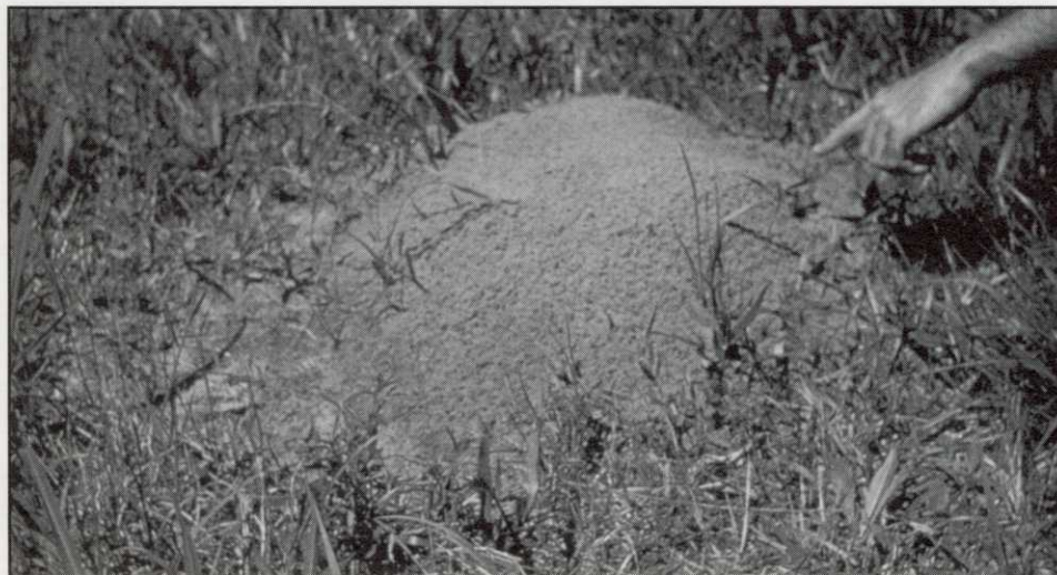
Large mound of the imported red fire ants.

Fire ants disperse naturally through mating flights, through colony relocation over short distances or by floating to new locations in floodwater. Humans also assist in the distribution or movement into new locations through shipments of ant infested nursery stock, sod, soil, hay, pine straw or beehives. Despite quarantine efforts aimed at preventing the movement of fire ants, it is not uncommon to find that imported fire ants "jump ahead" of the natural distribution due to movement of infested products.