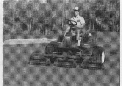
S-102S The Knowledgeable Operator 1 - Spanish Basics of Ride On Equipment Operation