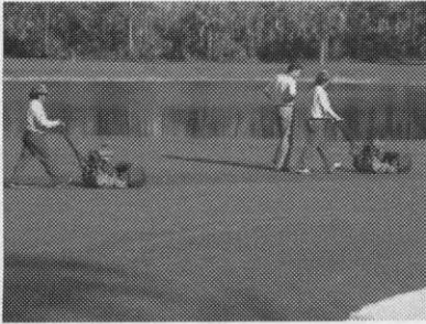
S-101S Greens Mowing Tips and Orientation - Spanish