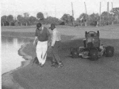
S-115S This is a Golf Course - Spanish