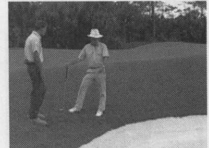
S-109S Crew Etiquette - Spanish