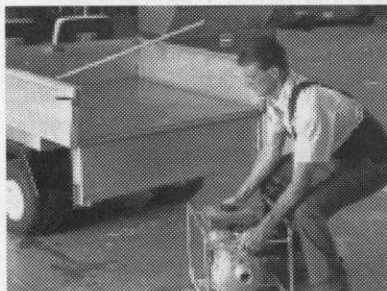
S-110S Safety Basics on the Golf Course - Spanish