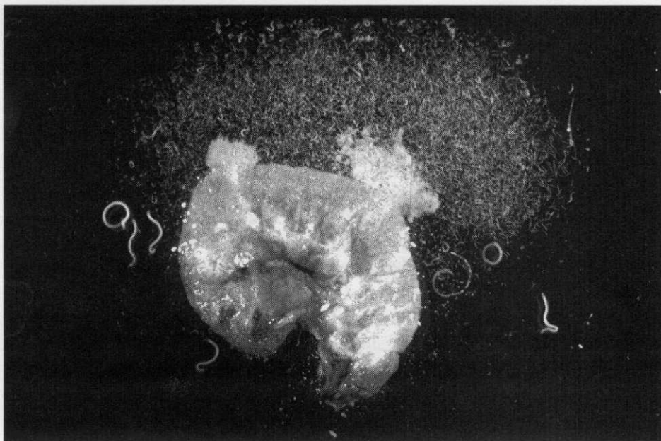
4. A Japanese beetle grub broken open to show the infection with Steinernema carpocapsae nematodes. The larger white curled nematodes are the adults while the "halo" around the body consists of hundreds of the new infective juveniles.