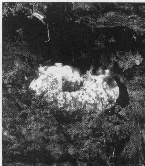
3. A northern masked chafer grub infected with Metarhizium fungus in the process of producing its greenish spores (the darker patches within the white mycelia).

Once a biological pesticide has been successfully isolated, laboratory tested and small plot tested, the next major hurdle is to produce sufficient quantities of the pathogen to perform large plot or commercial sized applications. For many pathogens, this means moving from "counter top" production (production of small quantities in petri dishes or flasks), to medium fermentor production (perhaps ten to 100 gallons at a time). At this stage, many biological pesticides suddenly run into problems. In the larger production setting, the pathogen may lose its virulence or activity. Many bacteria and fungi seem to become "lazy" in the larger fermentor setting. They may lose their toxins, or the amount of toxin produced may be reduced. They may lose their viability or survivability. Therefore, constant testing for quality control must be performed in order to ensure that the cultured pathogen remains as active as the original organism.