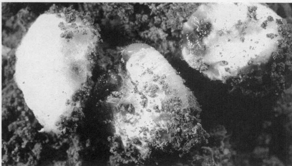
2. Japanese beetle grubs infected with Beauveria fungus.

zation, genetic makeup, etc.). Tests have to be performed to determine if the pathogen is, indeed, lethal to a target pest and if the new pathogen is an improvement over known pathogens. If the pathogen is sufficiently different from known examples and is an improvement, further development takes place and the pathogen is often "patented" in order to protect any future economic benefits.