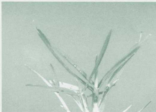
Leaf spot on Kentucky bluegrass

Despite expressing themselves as multiple diseases across the spectrum of cool-season turfgrass species, many of the Dreschlera and Pyrenophora species will only infect specific turfgrass species. Although symptoms are quite similar, regardless of the grass species infected, subtle differences do exist in disease expression