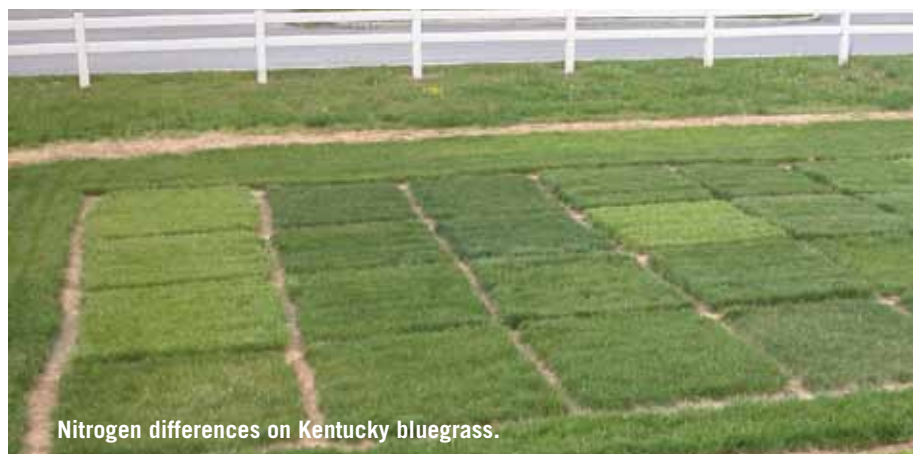
Nitrogen differences on Kentucky bluegrass.

Turfgrass species selection also affects the amounts of nitrogen needed. Bermudagrass, Kentucky bluegrass and perennial ryegrass generally require more input of nitrogen per year than any other turfgrasses being used on athletic fields. These grasses are vigorous and aggressively growing plants that require high nitrogen fertility. Increased rates of nitrogen must be applied in order to keep the plant healthy and able to recuperate from wear. Bermudagrass can receive rates of nitrogen per 1,000 ft 2 of 6-15 lb per year depending on geographic location and field usage.