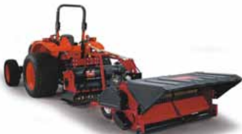
ProCore ® Processor