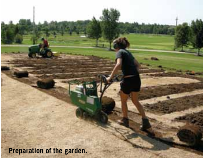
Preparation of the garden.