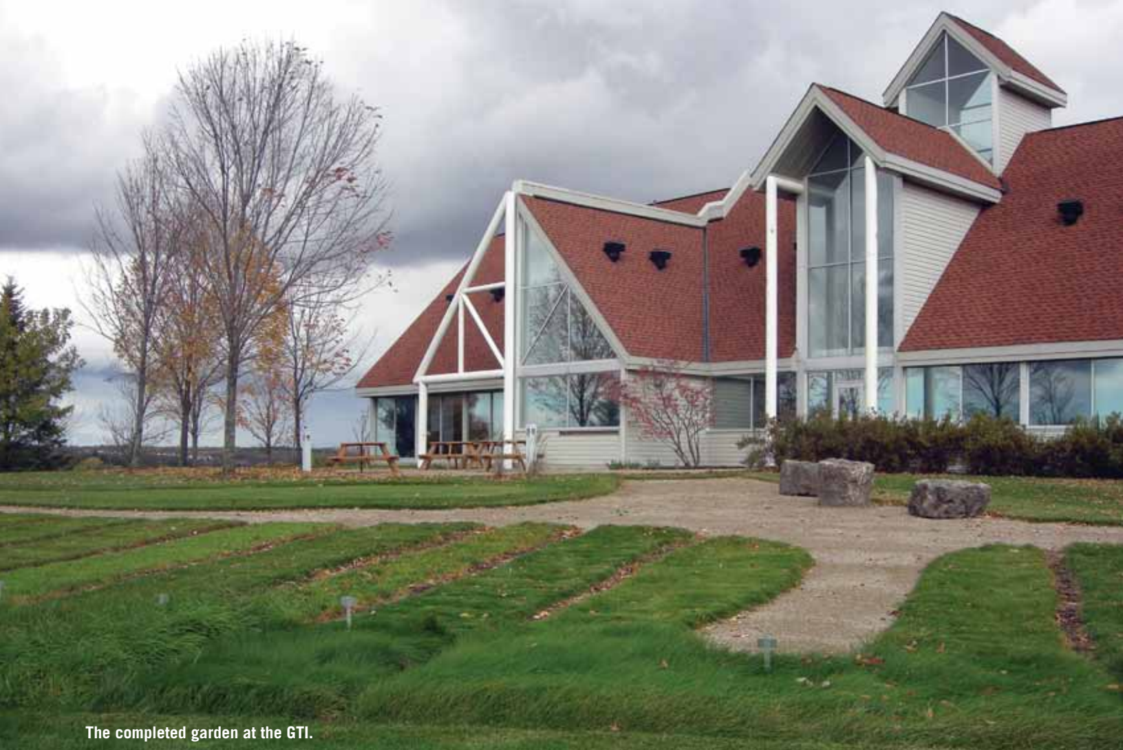
The completed garden at the GTI.