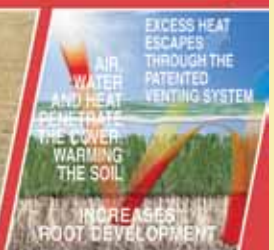
It works on the greenhouse principle, every time!

COVERMASTER INC., 100 WESTMORE DR. 11-D, REXDALE, ON, M9V 5C3 TEL 416-745-1811 FAX 416-742-6837