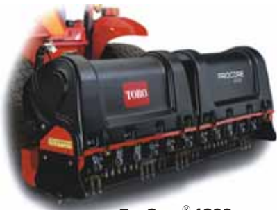
ProCore ® 1298