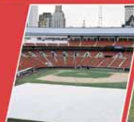
Covers for baseball fields are also readily available.