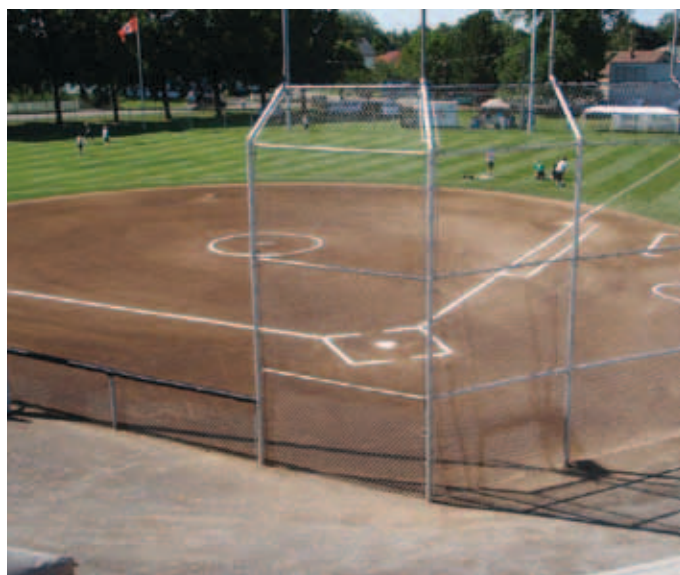
A City of St. Catharines' "Type A" sports field.

User groups are generally given first rights to their preferred usage times according to their bookings from the previous year.