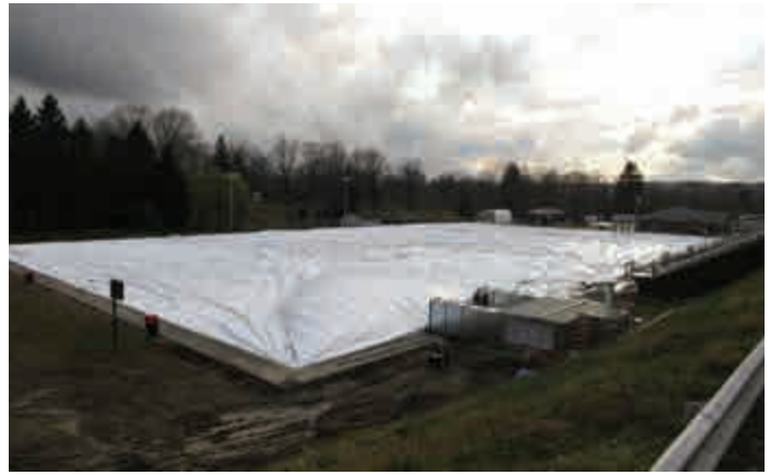
Dome spread out and connected to the grade beam, beginning inflation (Greenville, PA).

lighting system, and divider netting or curtains. All in all, the initial installation process usually takes anywhere from 1 to 3 weeks, depending on the size and complexity of the air structure package.