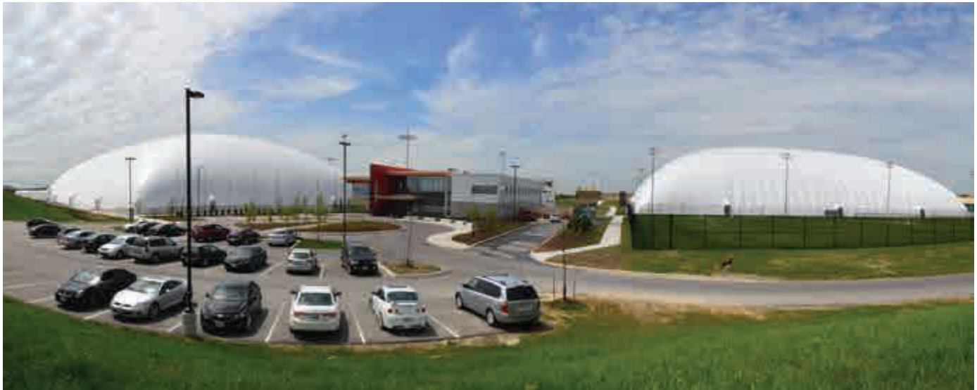
Two full field seasonal domes (Downsview Park, Toronto, ON).

R2 to R10. On medium to large sized domes, structural cables are installed over top of the fabric membrane to help stabilize it.