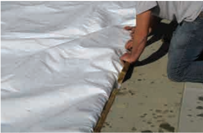
Fabric membrane being locked into anchoring system (Greenville, PA).