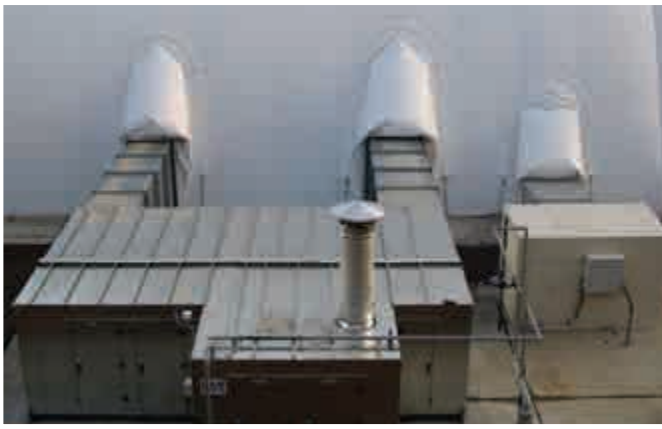
Main heat and inflation unit and standby inflation fan (Greenville, PA).