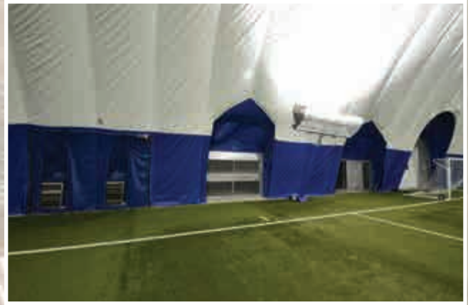
Interior view of fabric connectors for mechanical equipment and vehicle airlock (King City, ON).

for outdoor surfaces such as tennis courts to be played on after the warm season was over. He teamed up with a tennis club in Toronto and imported a “bubble” from Sweden, specifically patterned and manufactured to cover one tennis court. The fabric membrane was attached to an anchoring system around the perimeter and an electric inflation fan pressurized the interior of the bubble. That winter, people played tennis on the same court that they enjoyed their favourite pastime on in the summer months. The dome was deflated the next spring, rolled up and stored away and the court was played on in the summer as usual.