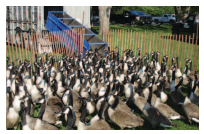
Head count taken as the geese go up the runway and board the transport.