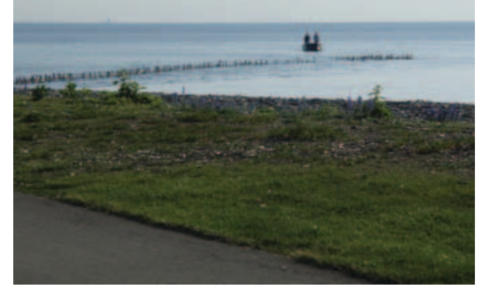
Three boats corral and direct the geese to come on shore.