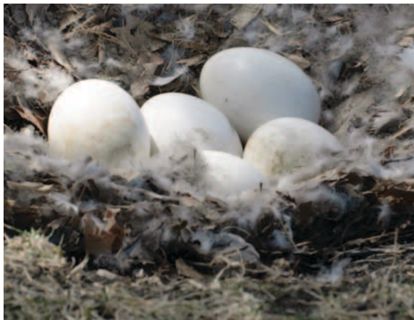
Figure 1. Canada goose nest with five eggs.

Canada is home and native land to most stocks of Canada geese — at least for some part of their life cycle. Being naturally migratory, these birds are capable of extraordinary migrations. Depending on the subspecies, these trips can extend thousands of kilometres. Typically, an annual migratory pattern consists of nesting on northern breeding grounds, migrating south for the winter (making some stops along the way), wintering in southern latitudes and then returning north again. Geese are extremely site faithful and repeatedly use the same route and teach the route to their offspring. Each species has a different migratory pattern; however, migratory pathways do overlap, particularly at temporary stopover sites in the spring and fall. During these times, members of threatened stocks may mix on fields with members of stocks with no conservation concern—even problem stocks.