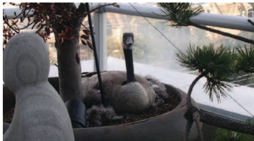
Non-migratory resident Canada goose nesting in planter (5th floor balcony), (Kelowna, BC).