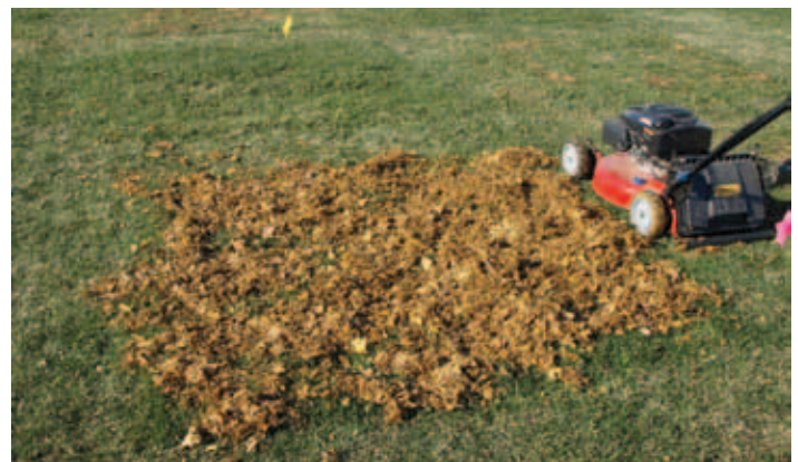
Figure 3: A plot containing a 5 cm depth of mulched ginkgo leaves.