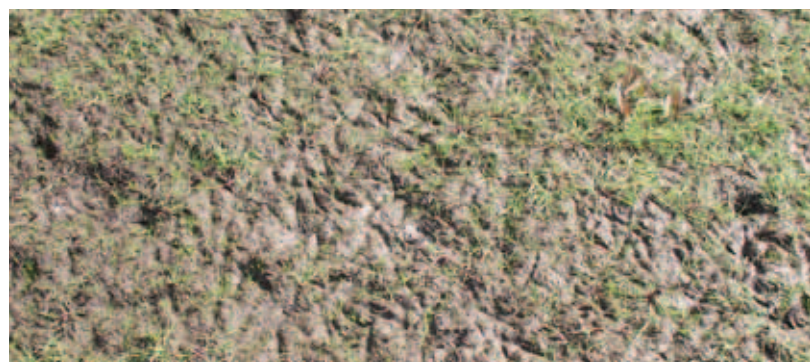
The result of geese grazing on pasture.

National Audubon Society. 2012. Christmas Bird Count Results Data and Research. Available: http://birds.audubon.org/christmas-bird-count (Accessed June 2012).