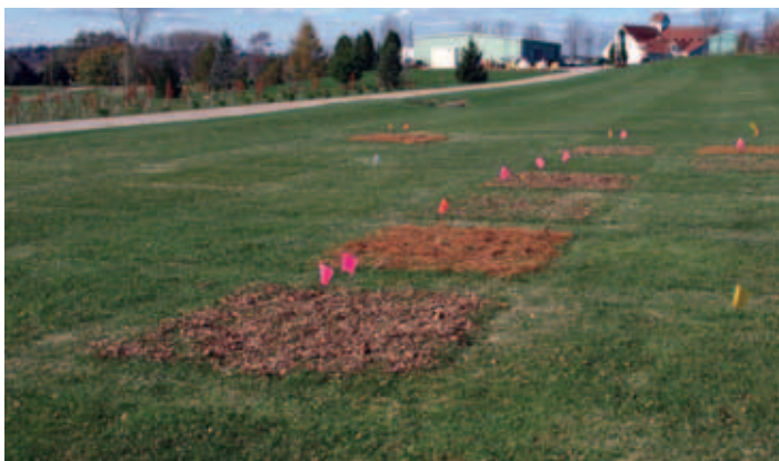
Figure 2: Research plots at the Guelph Turfgrass Institute with applied tree leaf and needle mulch.