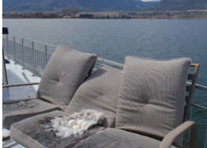
Non-migratory resident Canada goose nest on houseboat (District of West Kelowna, BC).