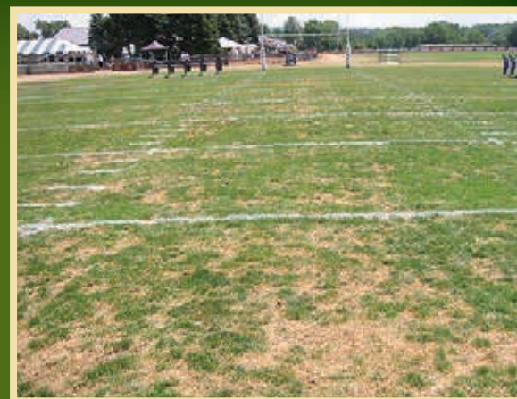
Figure 3. Intense wear often occurs down the center of fields. Apply the majority of your seed in these locations.