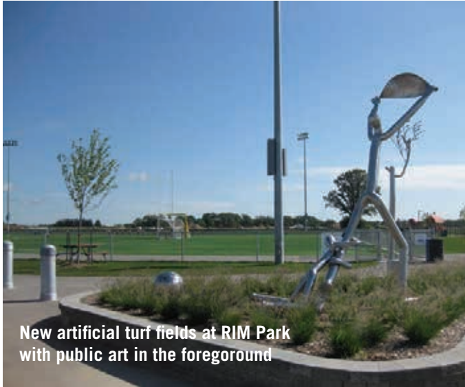
New artificial turf fields at RIM Park with public art in the foreground