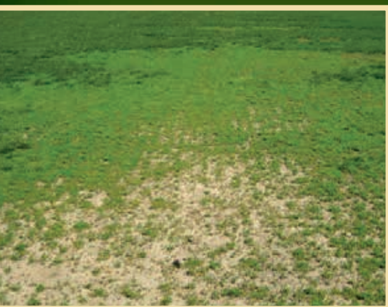
Figure 1. Regular overseeding will result in more turf cover and less weed invasion such as the knotweed found in the center of this field.

The most effective and beneficial method is hollow-tine aerification. Select tines that remove the largest size cores (3/4-inch is typical) and set the spacing on the machine as close as possible. Large tines combined with close spacing will give you the best results. While hollow-tine aerification is best, it also causes the most amount of surface disruption and your field will need time to recover before it can be played on again. If your maintenance time-window is short, use solid tines. Solid tines do not remove soil cores so compaction is unaffected, but using solid tines does increase oxygen levels and water infiltration. You can also use a deep-tine aerator, which penetrates to depths of up to 16 inches and fractures the soil below the surface, increasing soil oxygen. Other methods of aerification include verticutting, slicing, spiking, and water injection. Aerifying when it is too dry will limit tine penetration into the soil and if it is too wet, the sides of the aerification hole can glaze-over and seal-up. So, it is best to avoid extremely wet and dry conditions. Deep-tine aeration is an exception. The soil should be dry so that the soil fractures easily.