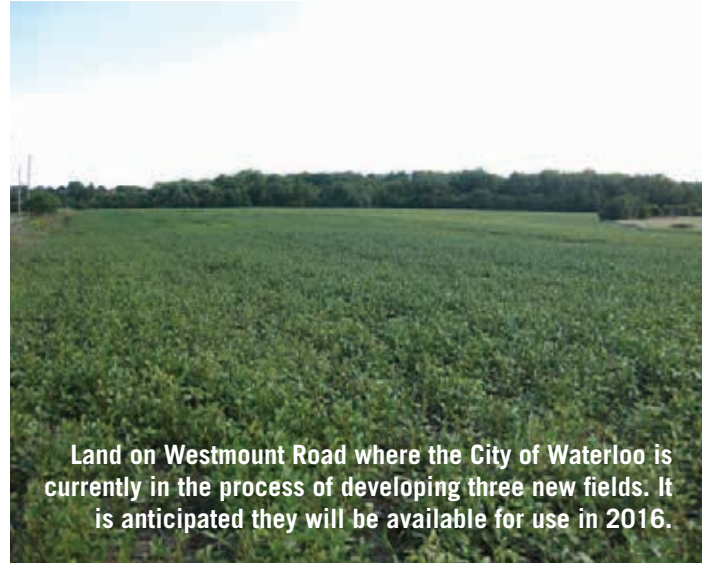
Land on Westmount Road where the City of Waterloo is currently in the process of developing three new fields. It is anticipated they will be available for use in 2016.

The inventory also examined ownership of fields booked through the City.