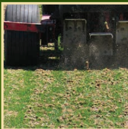
Figure 2. Aerification is a key component of managing high traffic fields