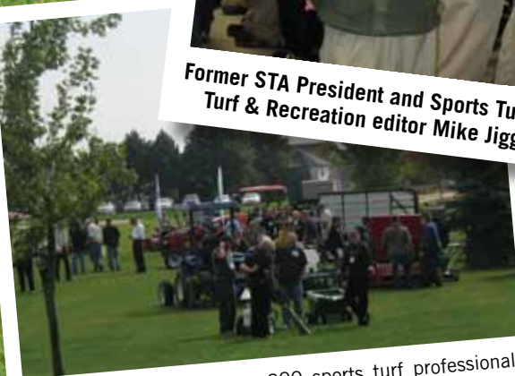
STA Annual Field Day. Over 200 sports turf professionals, students and industry suppliers gathered in Cambridge on September 23 for a great day of education and networking.