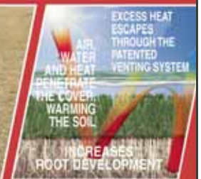
It works on the greenhouse principle, every time!

COVERMASTER INC., 100 WESTMORE DR. 11-D, REXDALE, ON, M9V 5C3 TEL 416-745-1811 FAX 416-742-6837