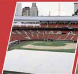
Covers for baseball fields are also readily available.