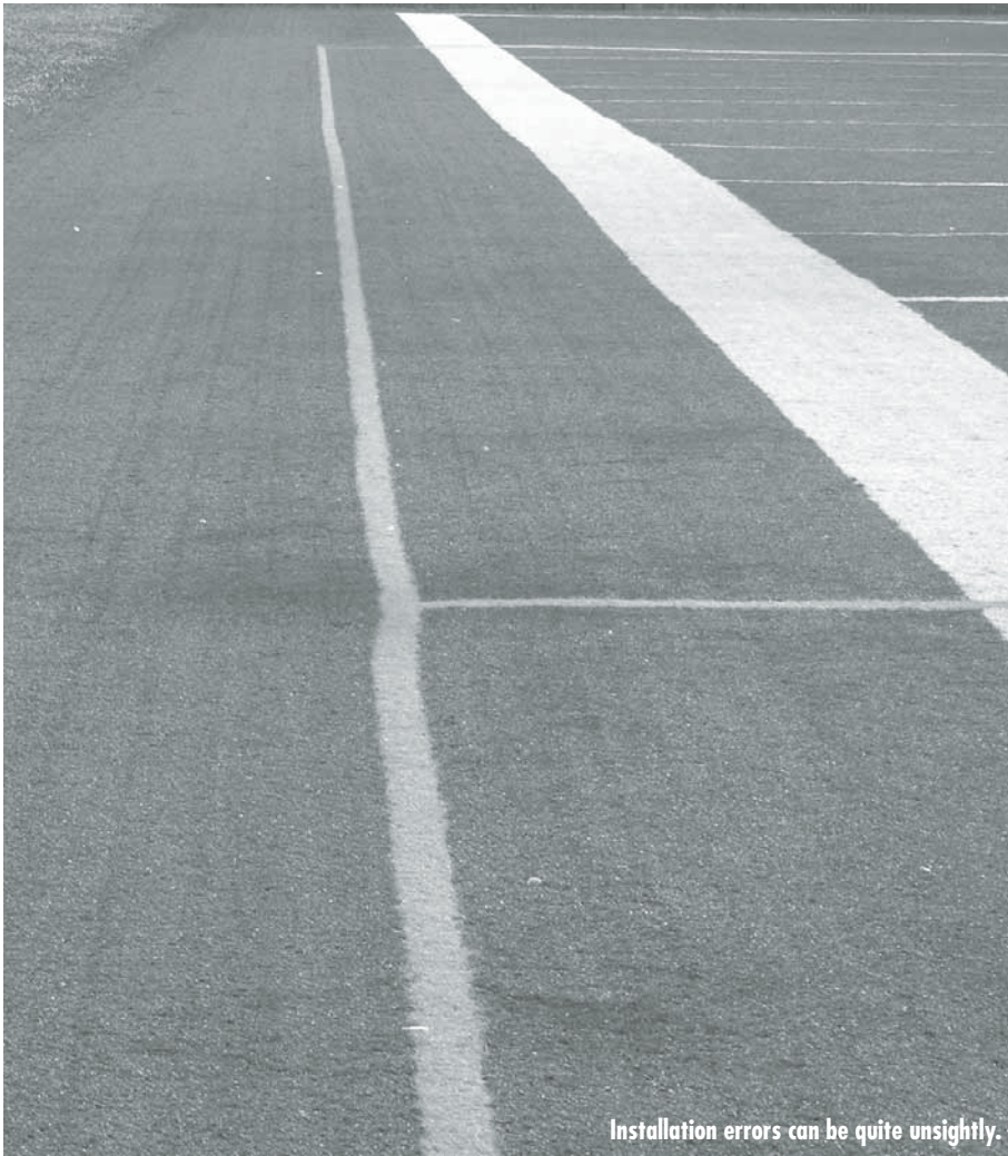
Installation errors can be quite unsightly.

FIFA is a forerunner in the field of synthetic sports turf quality control. At first, its system was designed for the sole purpose of certifying fields that were to be used in its officially sanctioned events. Eventually FIFA adapted it so it could be applied to all types of synthetic sports field projects.