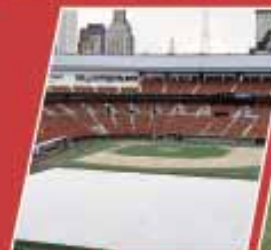
Covers for baseball fields are also readily available.