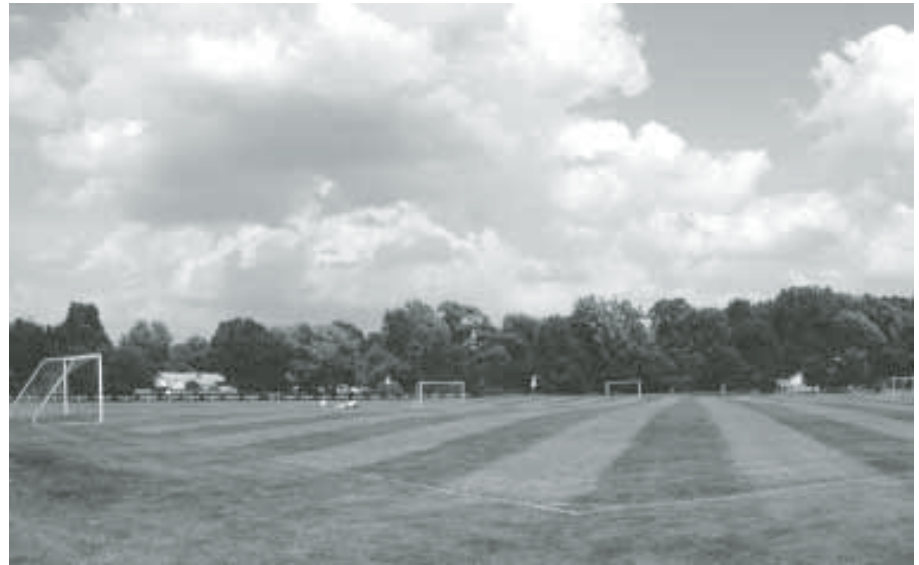
Figure 2. What a difference a mower makes! Same field, same problems (weeds, undulations) just mowed more frequently with better equipment.

1,000 sq.ft.). The majority of that nitrogen should be applied in late summer and fall. Generally, a balanced fertilizer of nitrogen (N), phosphorus (P) and potassium (K) is applied, with at least 50% of the content slow-release. Phosphorus and potassium applications are usually only made if they are deficient in the soil, so a soil test is recommended – every year on sandy soils and every 3-5 years on native soil. The uptake of nutrients into the turf plant is reliant on a growing root system, so healthy soil conditions are paramount.