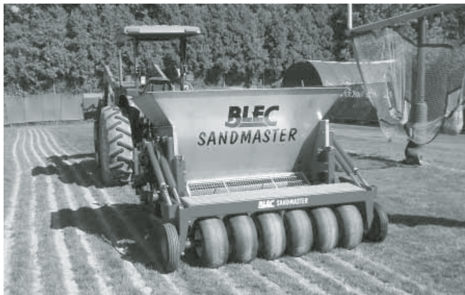
Figure 1. A "by-pass" system being installed. Sand slits create drainage channels from the field surface to underlying drains. The slits must be toppedressed annually with sand or they can cap off/seal over.

Mowing practices dictate turf health. Turf that is mowed once every 10 days at 75-100 mm height (3-4 inches) with blunt mower blades will invariably look like a