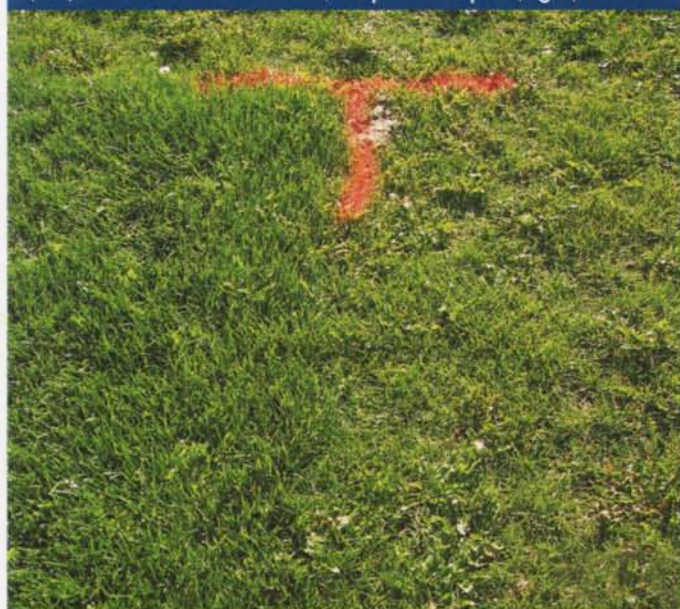
Fig. 2: Difference between 8 cm fertilized, no pesticide plot (left) and 4 cm non-fertilized, no pesticide plot (right) at GTI.

management programs: conventional, IPM, alternative and no-pesticide. Within each management program, the plots were subdivided into three superimposed treatments including: fertility (0 kg N/100 m 2 vs. 2.0 kg N/100 m 2 ), mowing height (4 cm vs. 8 cm) and irrigated vs. non-irrigated to demonstrate the effect that these treatments have on turf quality. The amount of irrigation was based on rainfall values. Unlike the previous two years, this year there was little rainfall and the effects of irrigation vs. non-irrigation could be observed.