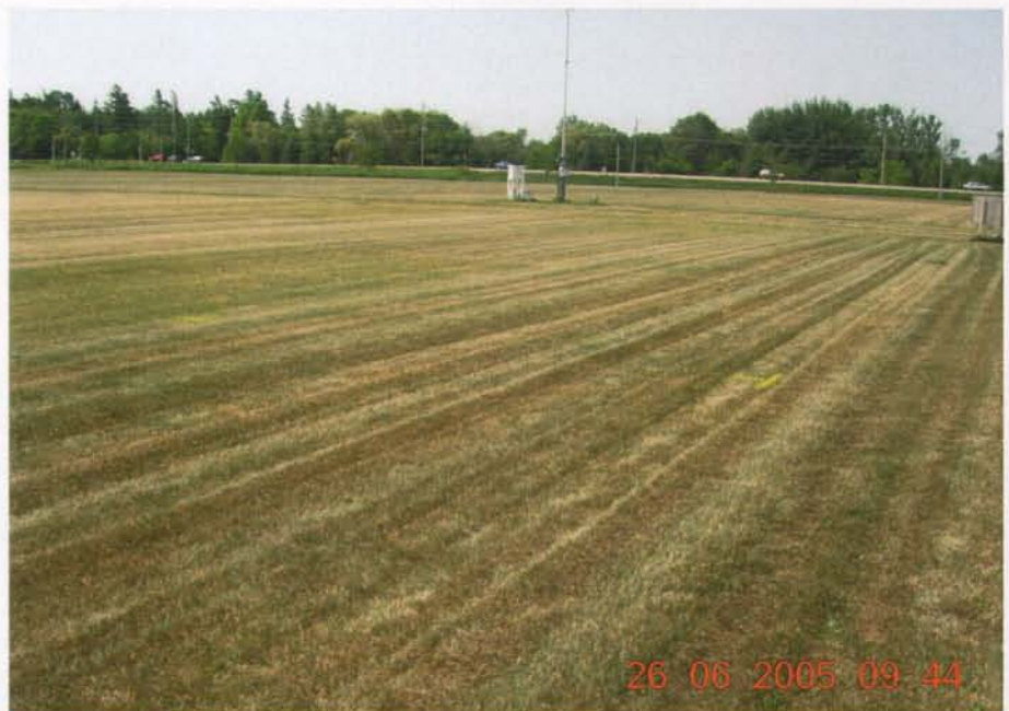
Fig. 5: GTI. The effects of no irrigation and limited rainfall on the non-irrigation plots.

The next step of this project is to educate members of the community about the advantages of using IPM on their own lawns rather than conventional methods. By spreading the word, we can help protect the environment and have beautiful lawns as well.