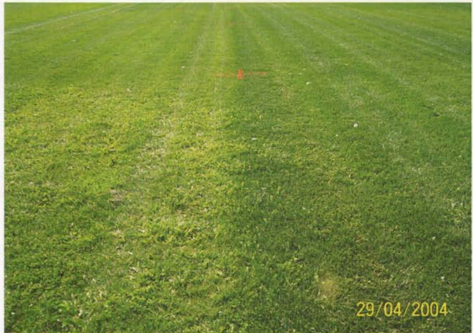
Fig. 4: GTI. Difference between the 4 cm non-fertilized (left) and 8 cm fertilized (right).

The cumulative results of the past three years have shown that IPM is a more environmentally friendly and efficient method of managing pests in turfgrass in comparison to conventional methods. It was also found that using fertilizer alone can greatly control broadleaf weeds and may be less costly than using pesticides all together.