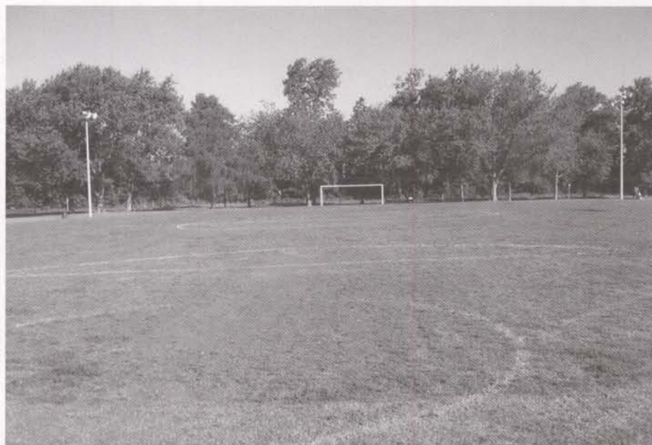
Lakeview West in July – not a pretty site! Dramatic improvements were seen by October.

We granular fertilize at least three times a year if scheduling and weather permits. Liquid fertilizer and other product trials have been applied a few times this year. >>>>