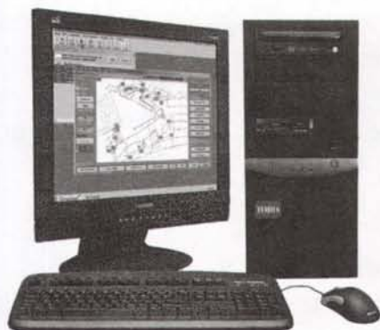
Sentinel Computer System

The Toro Sentinel “smart” control system provides a range of modular options for outstanding flexibility. Whether it be maintenance equipment like PDAs and hand-held radios, or our vast communication mode offerings—such as radios, ethernet, phone and fiber optics—Sentinel has you covered.