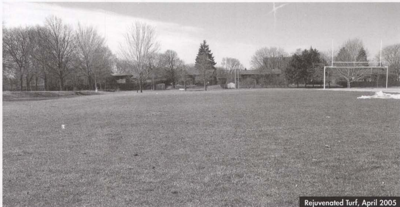
Rejuvenated Turf, April 2005

A sustainable system of PHC recognizes the importance of best practices associated with soil biological health and involving applications of quality organic materials. The organic management component of PHC is designed to work with nature. By consistently employing a particular organic set of turf management practices, healthy growth is encouraged while having the least possible negative environmental impact. The naturally beneficial qualities of plants are maximized with a healthy plant becoming its own best defence against stress. Key organic inputs are utilized as a collective set of tools that