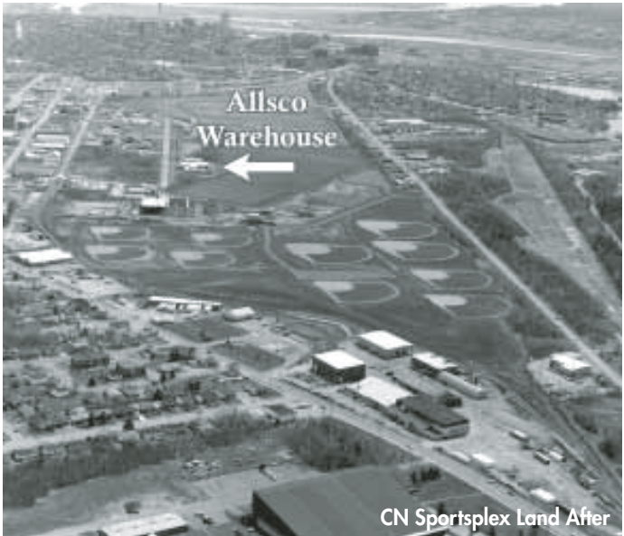
CN Sportsplex Land After