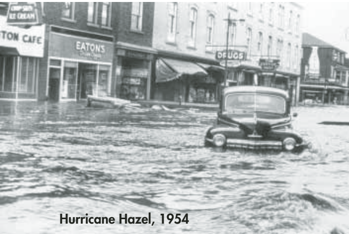
Hurricane Hazel, 1954

Later in the 1970s a regulatory approach was taken to deal with development within floodplains. Regulations were enacted by conservation authorities through the Conservation Authorities Act dealing with construction within floodplains, alteration of watercourses and the filling of valley systems and wetlands. Regional storm events were used as the regulatory storm event, which in the case of most of Southern Ontario is the Hurricane Hazel event that occurred over the Humber Watershed in 1954. In the early 1980s the federal and provincial governments sponsored the Flood Damage Reduction Program , which involved the mapping and delineation of floodplains by