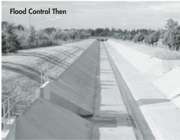
Flood Control Then