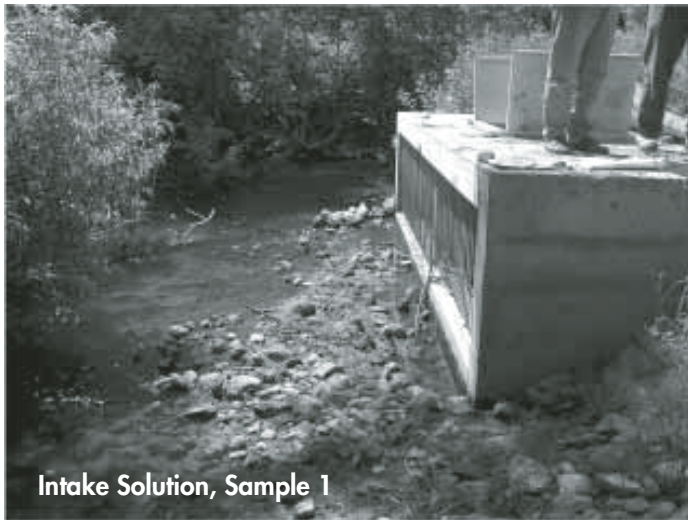
Intake Solution, Sample 1