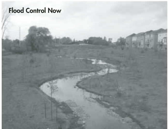
Flood Control Now