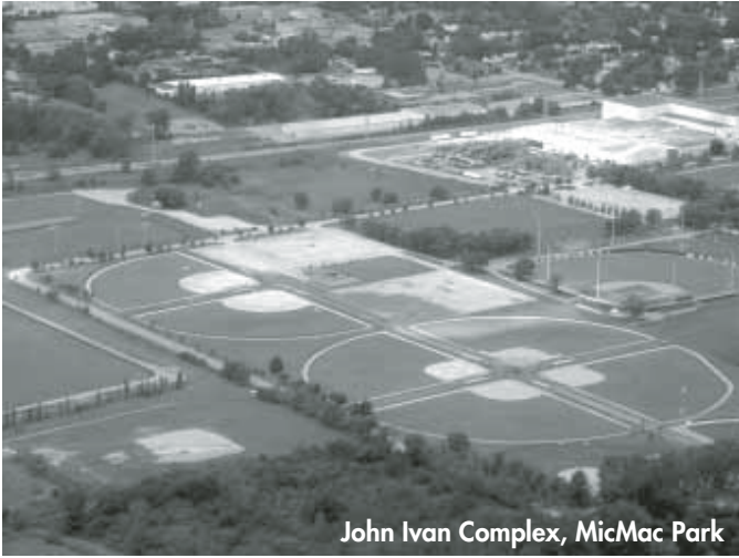
John Ivan Complex, MicMac Park

The City of Windsor implemented its Pesticide Use Bylaw in April, 2006. Meetings were held with both the public and commercial applicators to inform and educate on the particulars of the bylaw and what it entailed.