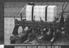
DIAMOND MASTER: MODEL NO. 8-DM-6

The Diamond-Master ® (pictured) and Ballpark-6 ® groomers will give your community ball diamonds a surface just like the professional teams demand, and reduce the time, effort and labour required to do the job.