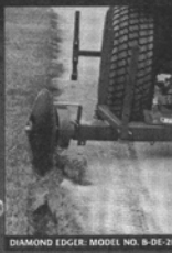
DIAMOND EDGER: MODEL NO. 8-DE-30

With its adjustable guide shoe, the Bannerman Diamond Edger is surprisingly easy-to-use. Its three-inch blade depth and reversible, 20-inch concave disc work together to quickly eliminate ridging. Debris is spiraled into the infield for fast and easy clean-up.