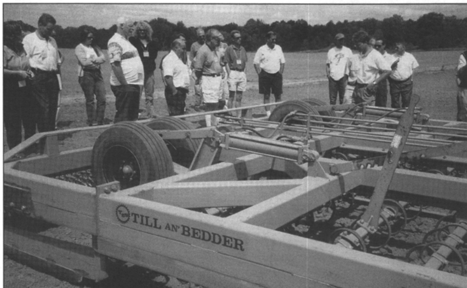
The Schmeiser tiller and bedder used at Compact sod farms to cultivate and firm the land area prior to seeding.

soil that was in the way of a subdivision for the City of Cambridge. They used 300 triaxle trucks for two months to haul 5,000 metres of soil onto a 70 acre area and spread it one foot deep. He wanted to mix the clay soil with an existing sandy loam. Quite a project!