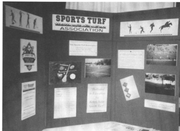
The Sports Turf Association display at the Ontario Turf Grass Symposium.