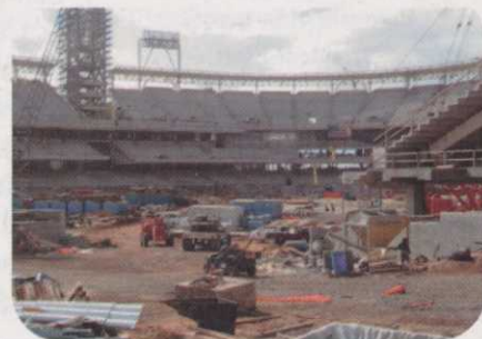
Petco Park - under construction

has the distinction of being the only stadium left in the majors that originally housed a minor-league team before major-league expansion. The old Pacific Coast League San Diego Padres played in Qualcomm