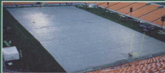
Full size covers for football and soccer are readily available