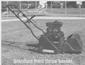
Standard front throw basket