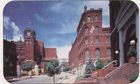
The St. Louis landmark brewery tours feature visits to the bottling plant, and the stables of the world famous Clydesdales.

There are also Anheuser-Busch Brewery Tours which include the historic Brewhouse and the Budweiser Clydesdale stables, as well as the lager cellar and packaging plant. AND The St. Louis Cardinals Hall of Fame