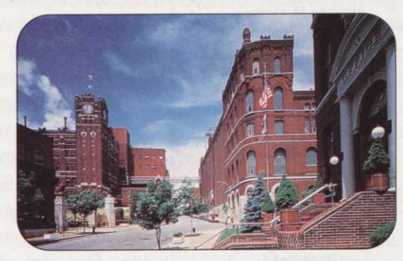
The St. Louis landmark brewery tours feature visits to the bottling plant, and the stables of the world famous Clydesdales.

There are also Anheuser-Busch Brewery Tours which include the historic Brewhouse and the Budweiser Clydesdale stables, as well as the lager cellar and packaging plant. AND The St. Louis Cardinals Hall of Fame