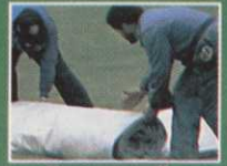
Easy to install