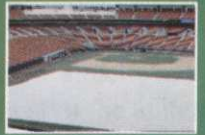
Any size cover

COVERMASTER INC., 100 WESTMORE DR., 11-D, REXDALE, ON, M9V 5C3 TEL 416-745-1811 FAX 416-74-COVER (742-6837)