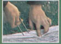
Anchor pegs supplied