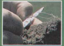
Deeper root development